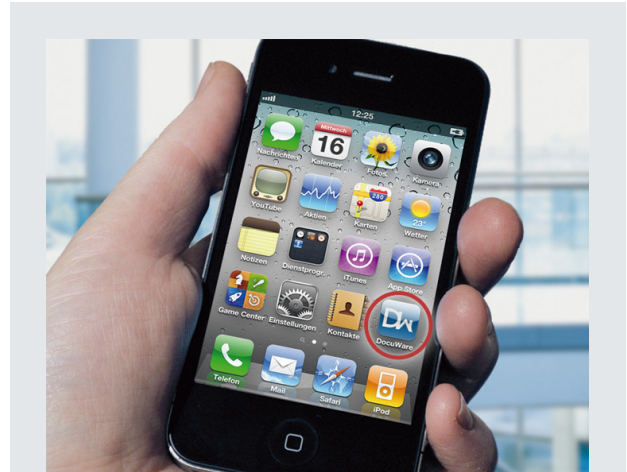
DocuWare can be installed free of charge as an iPhone app.

DocuWare Mobile can be used with numerous mobile devices, such as the iPhone, iPad, iPod, Blackberry smartphones, devices with Windows Phone 7 and Android as well as tablets with Windows 8. The feature set may vary slightly depending on the device and operating system. On Apple mobile devices, you can choose whether you want to access the document management via the DocuWare Mobile app or via an HTML5 compatible browser such as Safari. If you access it via the browser, there is no need for any installation, however the app is generally able to work more quickly than is possible via the browser. For Blackberry and Android devices, access is only possible via the browser and, for smartphones with Windows Phone 7 and tablets with Windows 8, only with the app. More information about versions and features can be found below in the "10 Questions" box and in the DocuWare knowledge center at help.docuware.com/en/#t56452